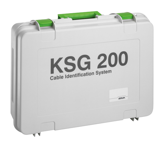
Figure: KSG 200 T (without battery)