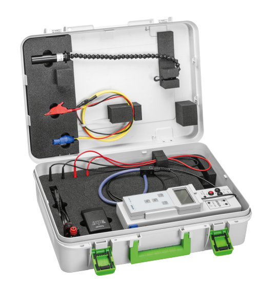
Figure: KSG 200 TA (with battery)